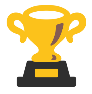
KS1 Presentation cup